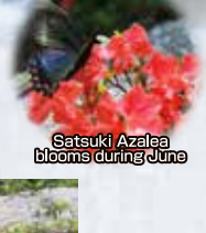
Satsuki Azalea blooms during June