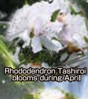
Rhododendron Tashiroi blooms during April