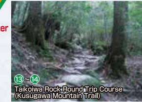
⑬~⑭ Taikoiwa Rock Round Trip Course (Kusugawa Mountain Trail)