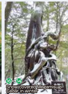
⑯~⑰ Snow covered Megamisugi Cedar in winter