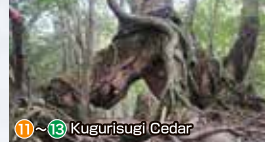
⑪~⑬ Kugurisugi Cedar