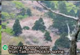
⑯ Cherry blossom seen from Taikoiwa Rock in spring