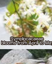
Symlococaceae blooms from April to May