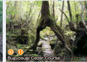
⑩~⑪ Bugyosugi Cedar Course