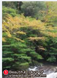
① Beautiful colors of Stewartia in autumn