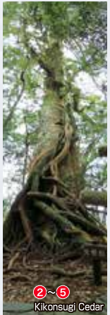
②~⑤ Kikonsugi Cedar