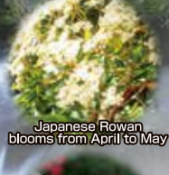
Japanese Rowan blooms from April to May