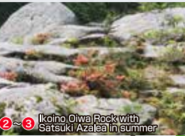
②~③ Ikoino Oiwa Rock with Satsuki Azalea in summer