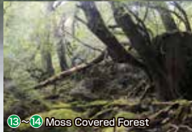
⑬~⑭ Moss Covered Forest